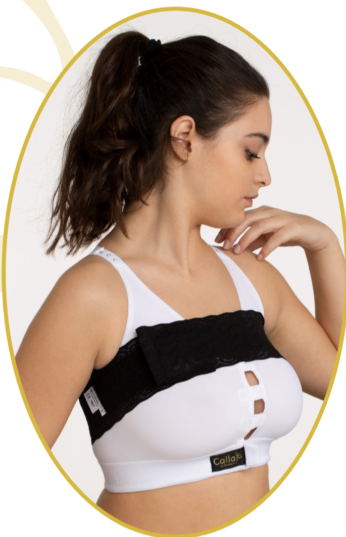
Lace covered elastic band