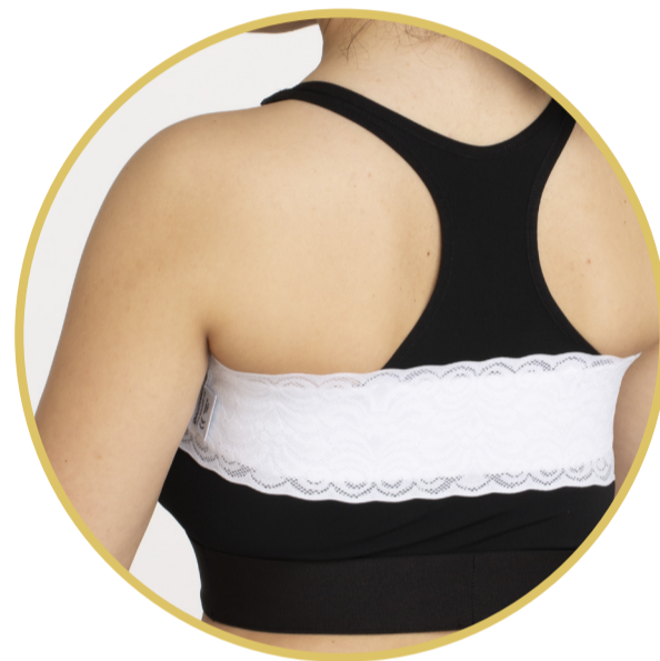
Available in white or black